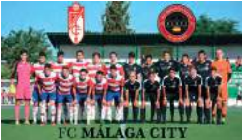
Nicholas FC Malaga City