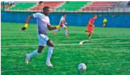
Ibrahim Foça belediyespor (Turkey)